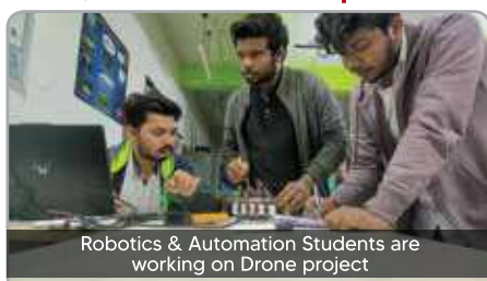
Robotics & Automation Students are working on Drone project