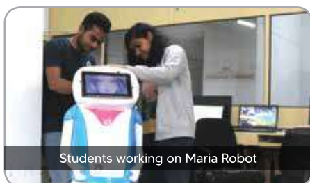
Students working on Maria Robot