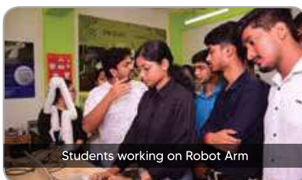
Students working on Robot Arm