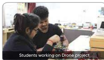
Students working on Drone project