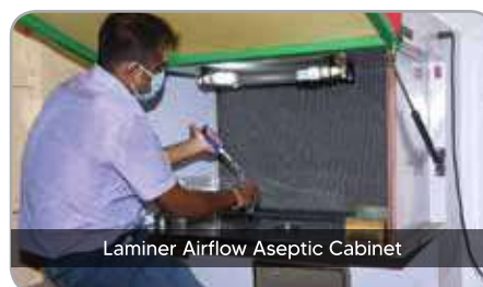
Laminar Airflow Aseptic Cabinet