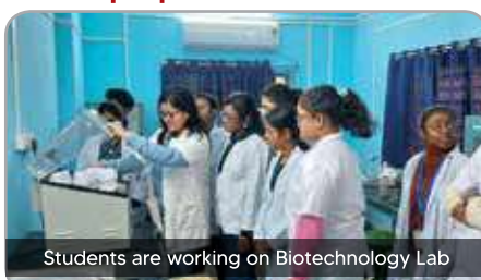
Students are working on Biotechnology Lab